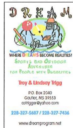
New logo and business cards!!!

and innovative. He is also one of our newest supporters and he has touched our hearts, we now consider him part of the DREAMPROGRAM family and we hope you will also.